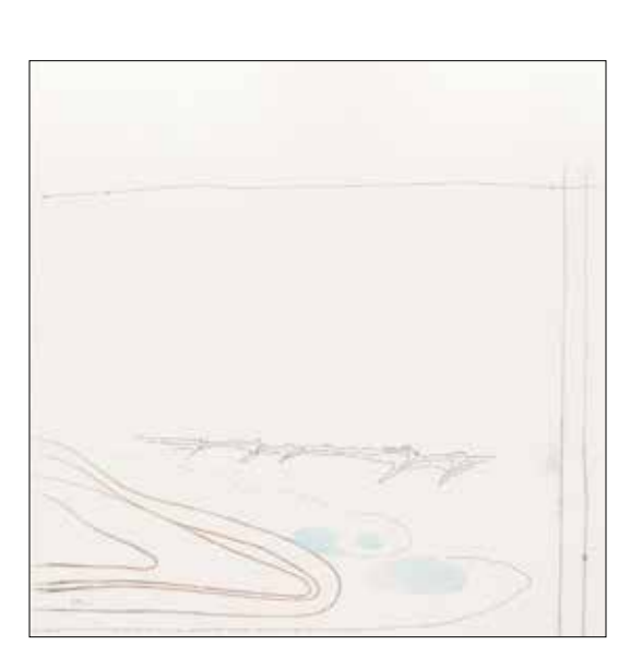
the artist's book of meanderings 2, (a selection of 8 from a series of 14) print base mixed media on paper 22"w x 22"h each, 2020