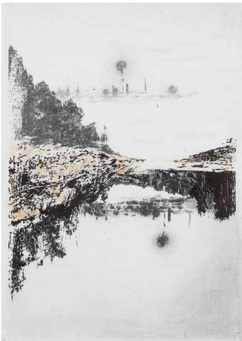
Untitled, Mixed media on paper 2020