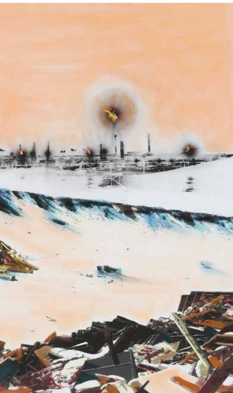
Untitled, Mixed media on paper 2020