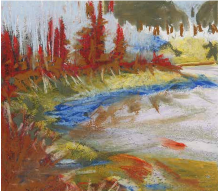
Untitled Mixed media on paper 2020